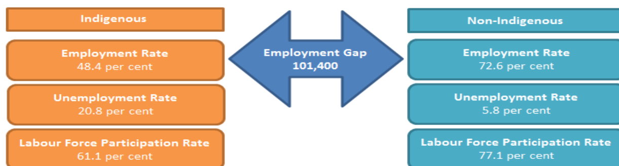
Chart 1: Comparison of Indigenous and non-Indigenous labour market indicators

Evidence 6,7 shows that low employment rates will continue to reduce Indigenous health, living standards and the social and emotional wellbeing of Indigenous Australians as long as the gap persists. Low rates of Indigenous employment are creating negative perceptions of Indigenous Australians. Beyond Blue found that one-third of people believe Indigenous Australians are “lazy” and should “behave more like other Australians”. 8