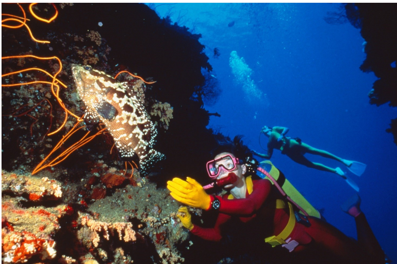
Divers and black cod (Department of the Environment and Energy)