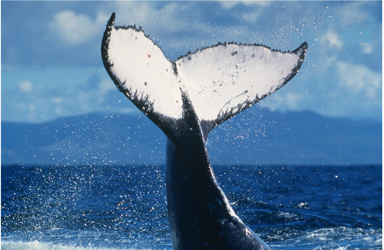
Humpback whale (Dave Paton)