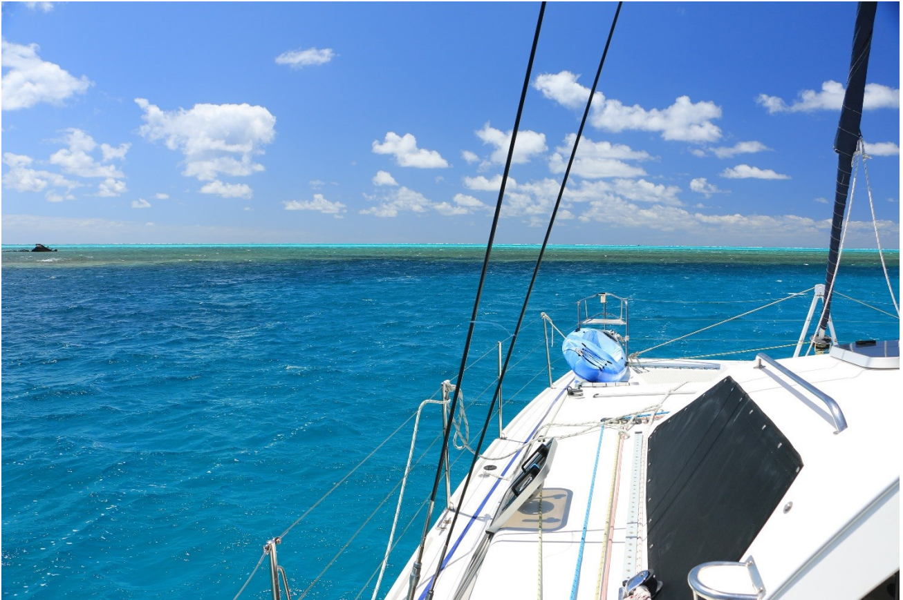
Sailing to Middleton Reef (Nicola Udy)