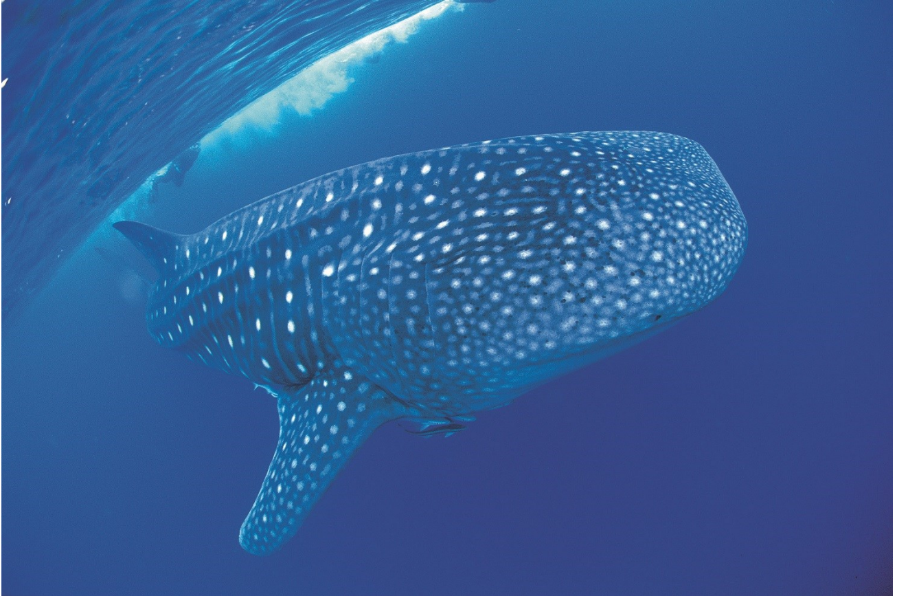
Whale shark