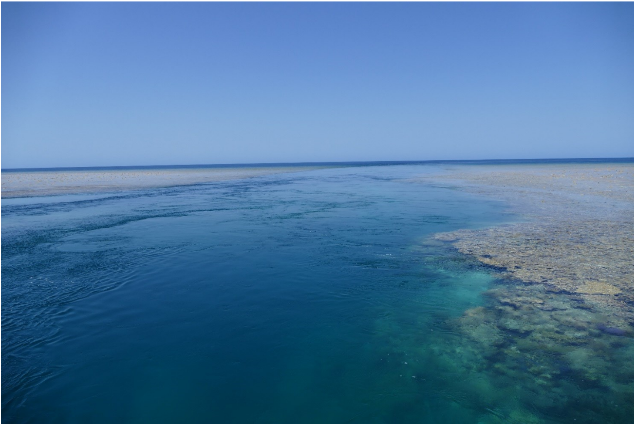
Reef channel at Rowley Shoals (Michelle Glover)