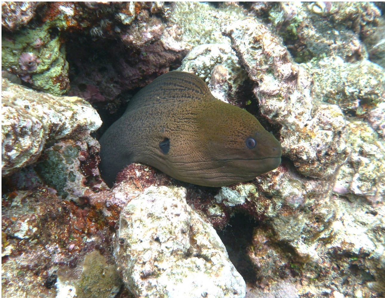
Moray eel