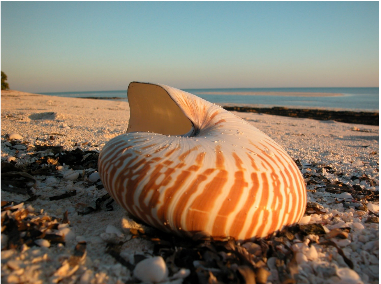
Nautilus- Ashmore Reef