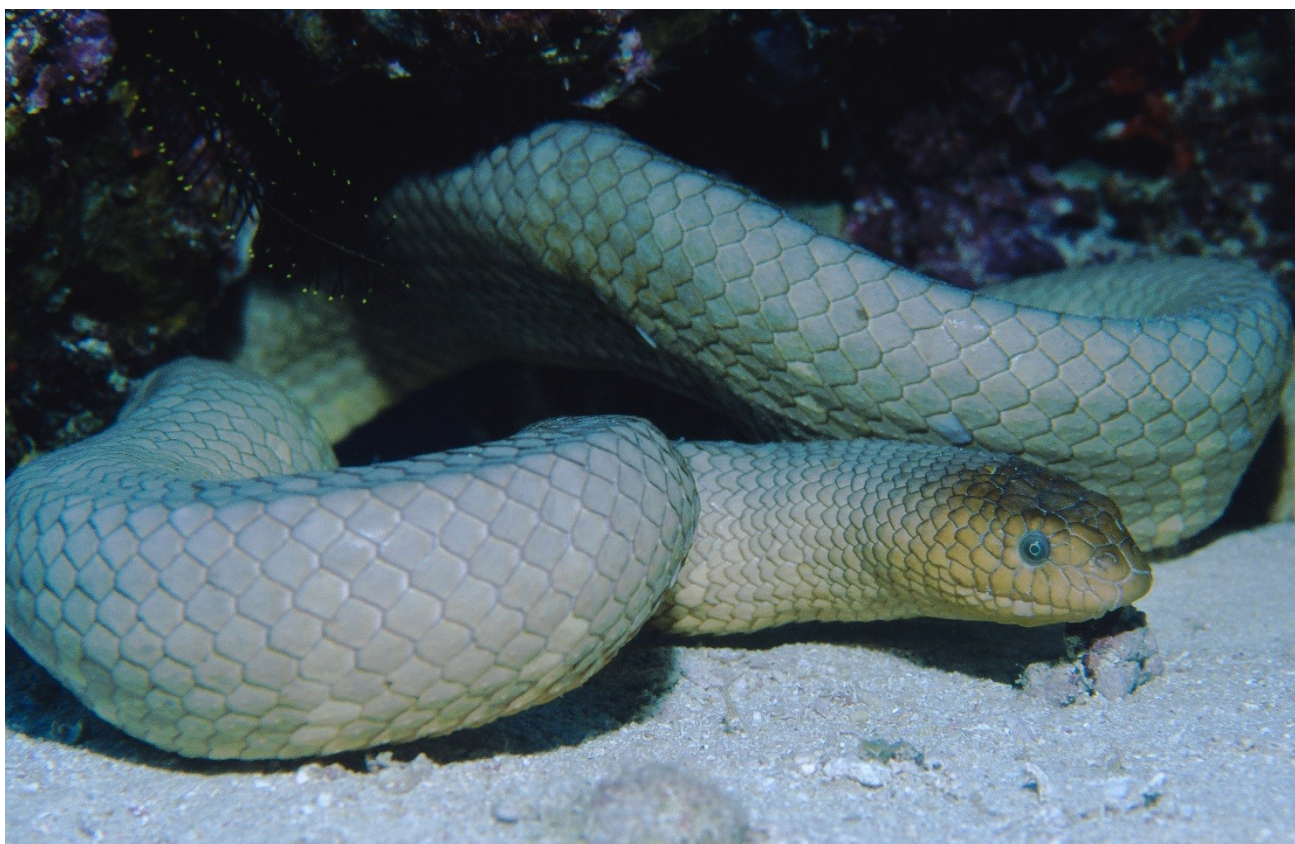
Olive seasnake