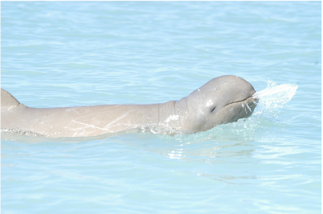
Australian Snubfin dolphin (Deborah Thiele)