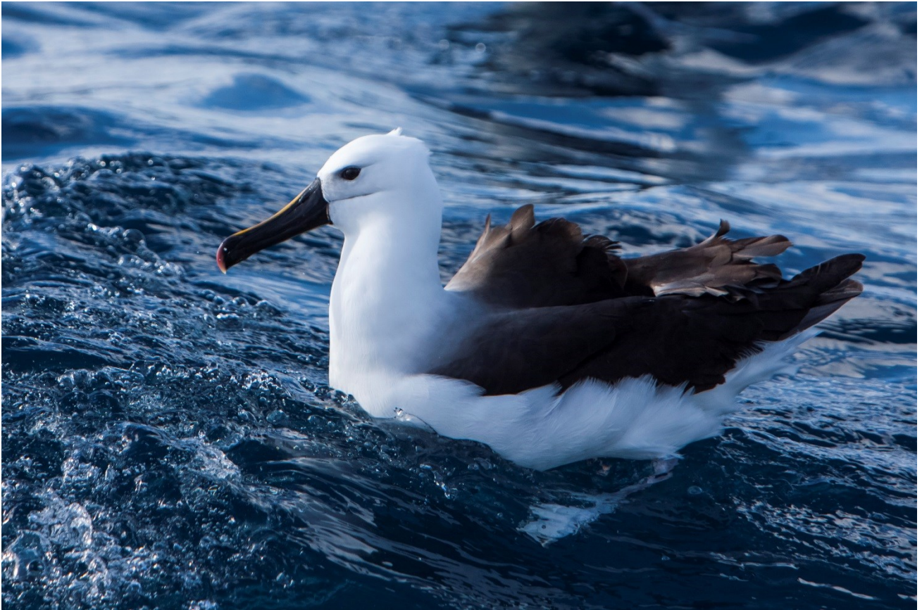
Indian yellow-nosed albatross (Georgina Steytler)