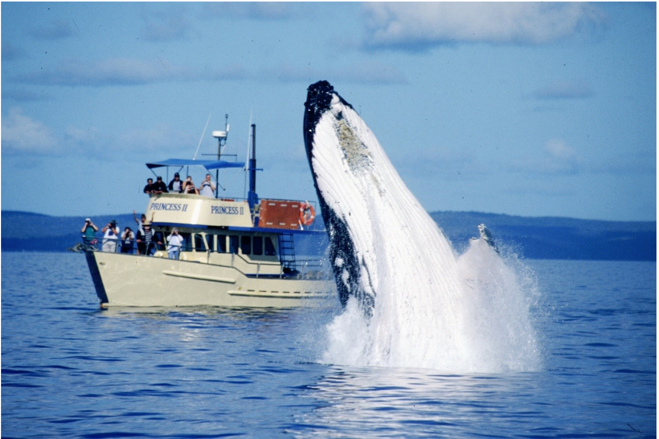
Humpback whale and tourist vessel