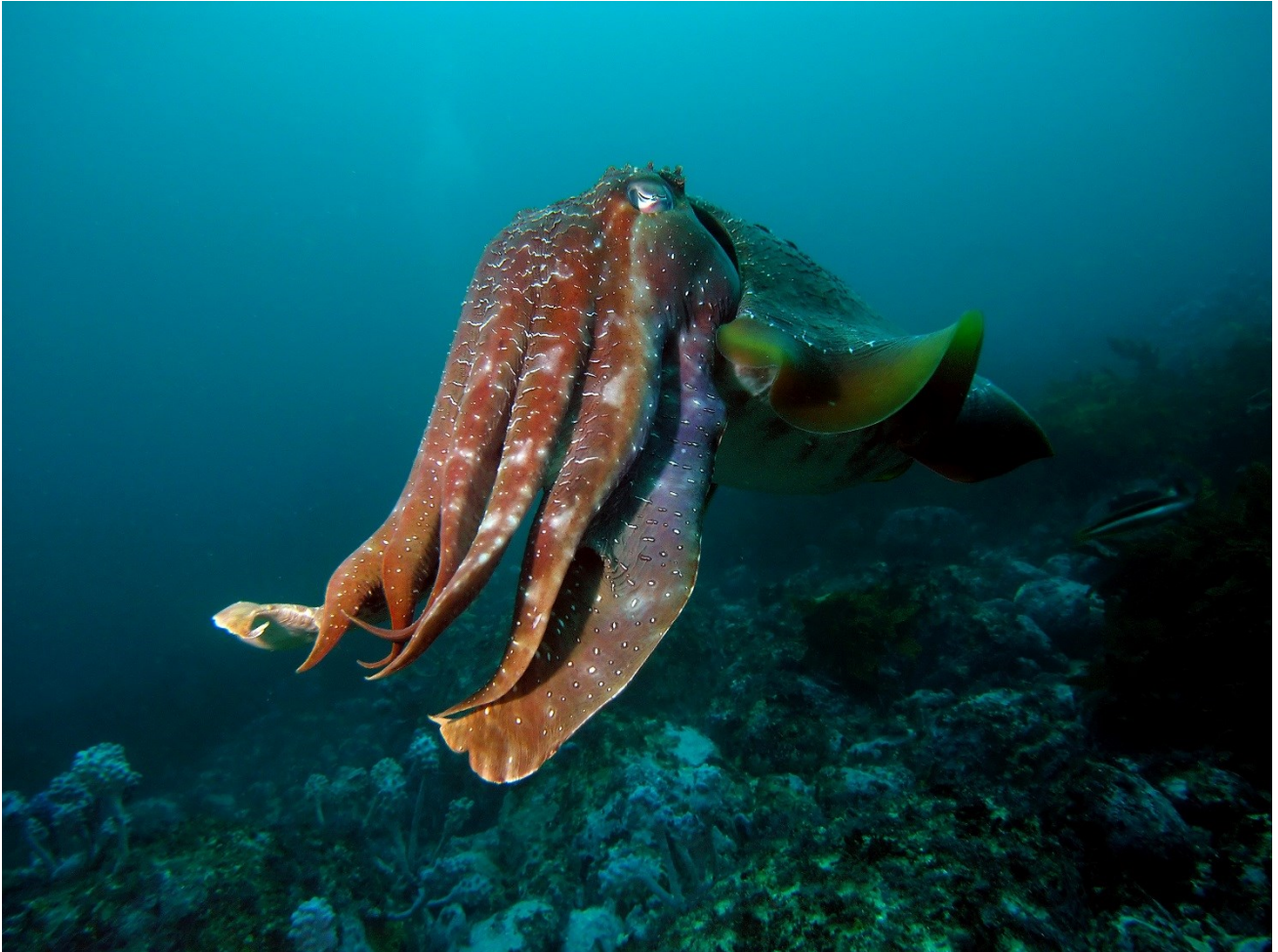
Cuttlefish