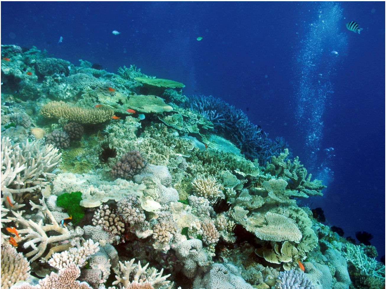
Osprey Reef (Parks Australia)