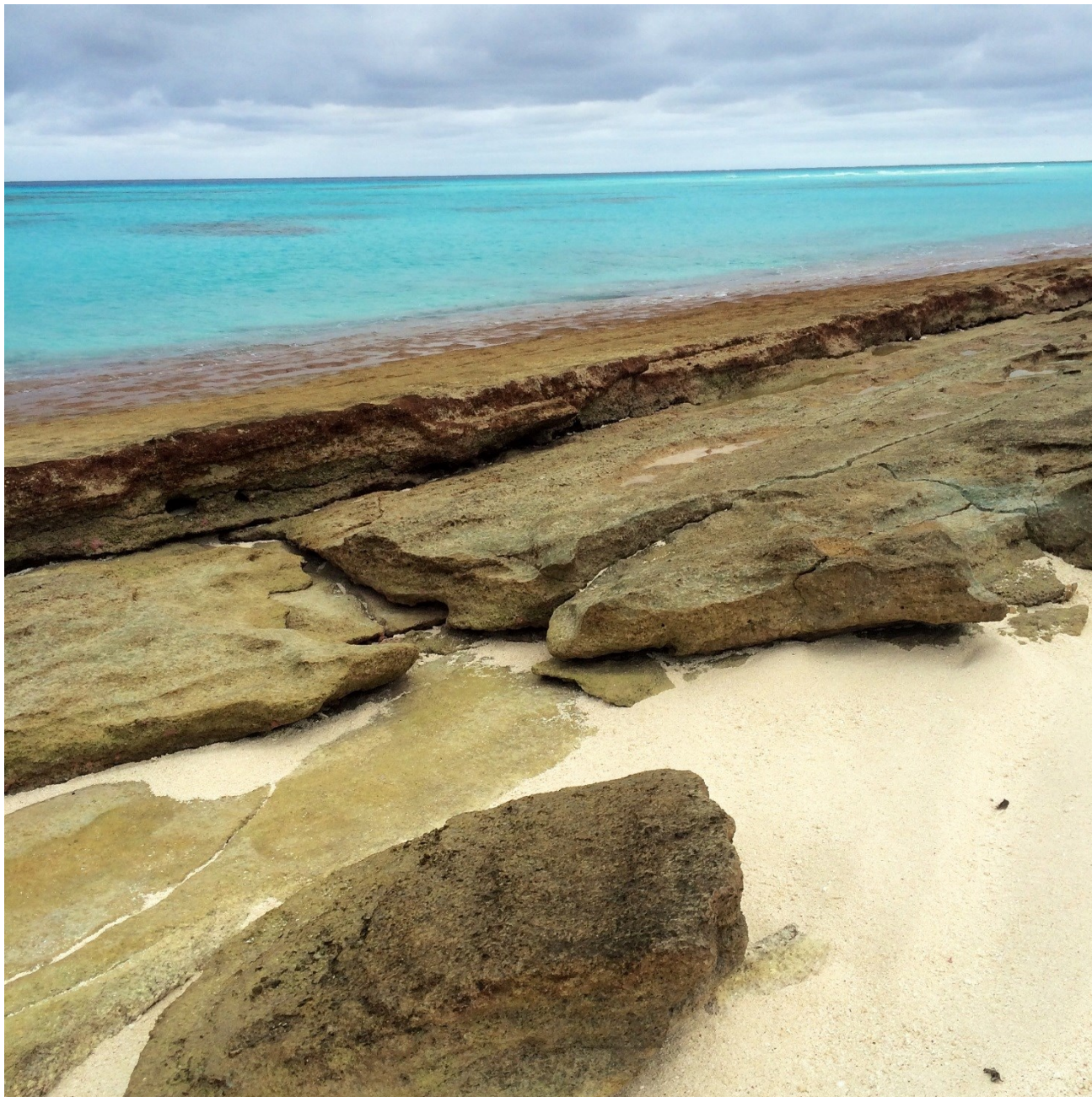
Lihou Reefs