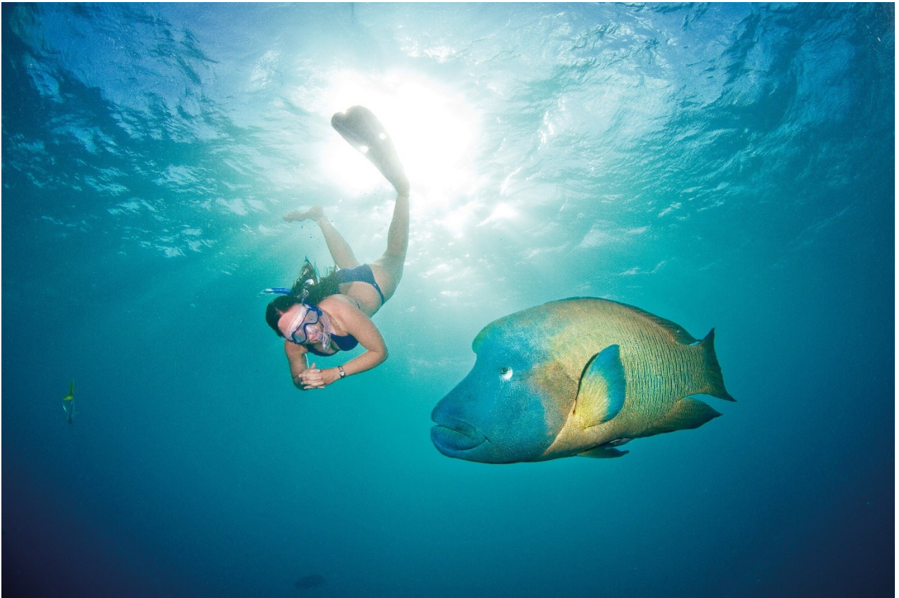
Snorkeler and humthead Maori wrasse