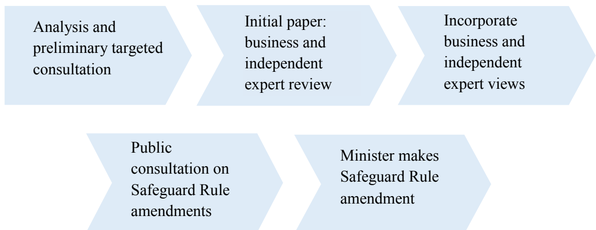
Figure 1: Consultation and development process

On 6 May 2021, the Government released the proposed amendments to the Principal Rule together with an accompanying explanatory document and detailed technical definitions document. Comments closed on 3 June 2021. Six submissions were received from the public consultation process.