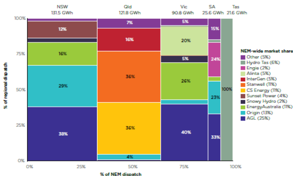
Figure 1: Market share by generation dispatched by region, year to April 2018

Generation ownership in the NEM has become increasingly concentrated over recent years, and is concentrated amongst a few key players in most regions (see Figure 1).