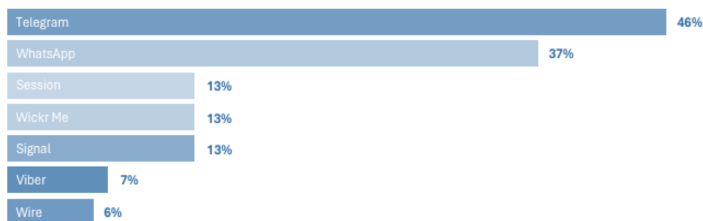
Messaging apps used to search for, view, and share CSAM Question 5 ‘What messaging app have you used to search, view, or share CSAM?’ n=358

Figure 2 Messaging apps used to search for, view and share CSAM (Suojellaan Lapsia, Protect Children ry., 2024)